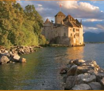
Vacation destinations are becoming more adventurous than ever before. Great river vacations are available in England and Ireland.